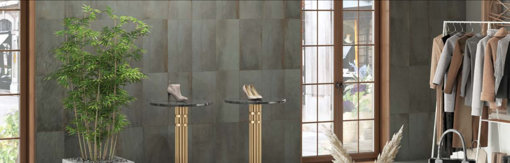
above: FDY30 12x24 Graphite