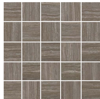
28155/M12 Waters Edge Mosaic