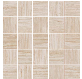
28130/M12 Sand Castle Mosaic