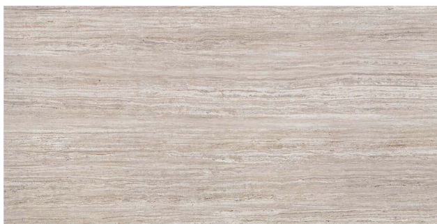
28115 12x24 Marine Fog