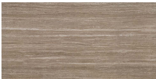
28190 12x24 Coconut Shell