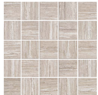
28115/M12 Marine Fog Mosaic