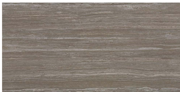
28155 12x24 Waters Edge