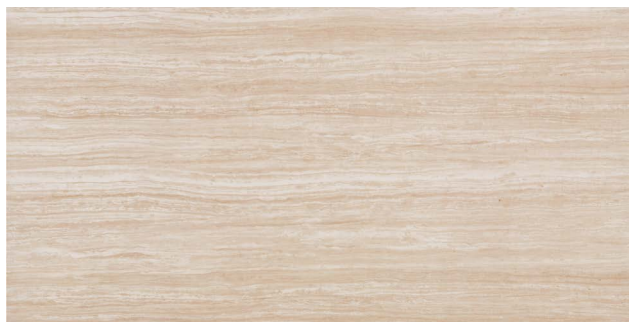
28130 12x24 Sand Castle