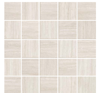
28110/M12 Sea Salt Mosaic