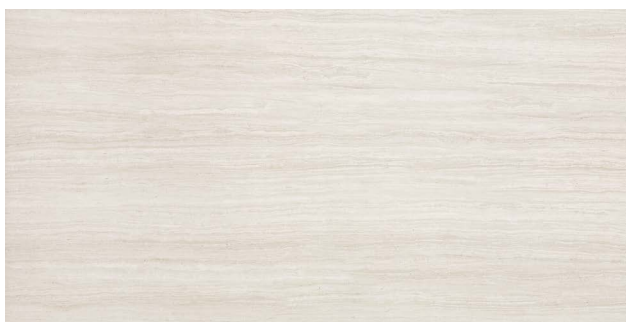
28110 12x24 Sea Salt