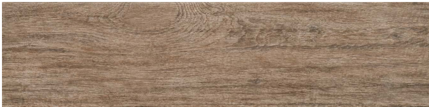
28092 6x24 Charleston Brown