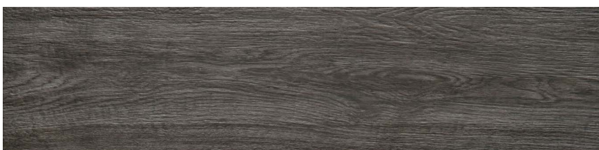
28017 6x24 Cape Cod Charcoal