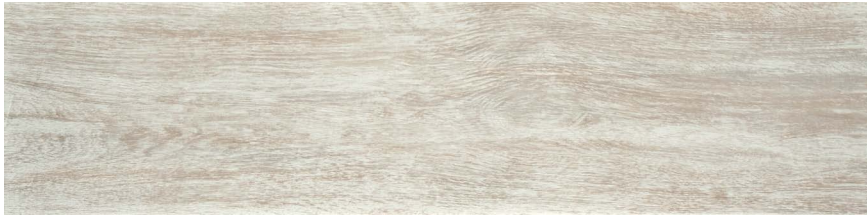
28004 6x24 Wilmington White