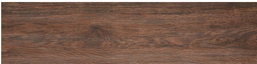
28088 6x24 Cayman Red