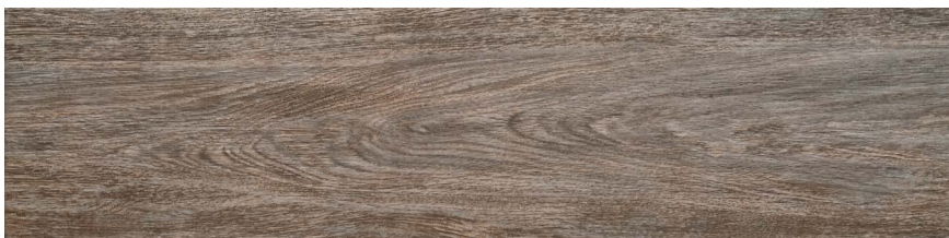
28013 6x24 Nantucket Gray