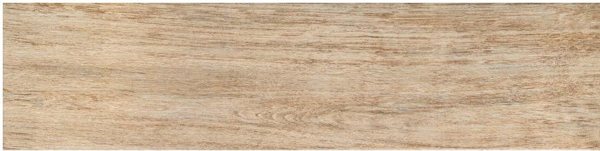
28034 6x24 Hampton Blonde