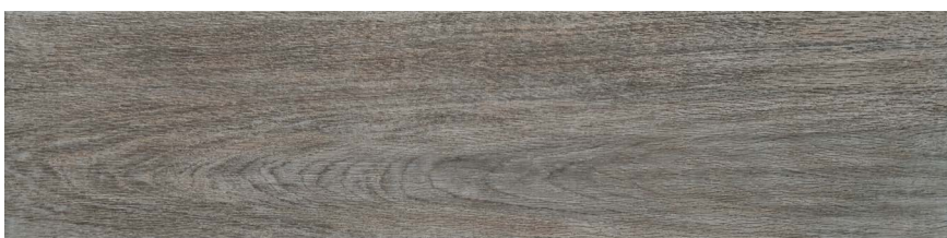
28060 6x24 Newport Blue