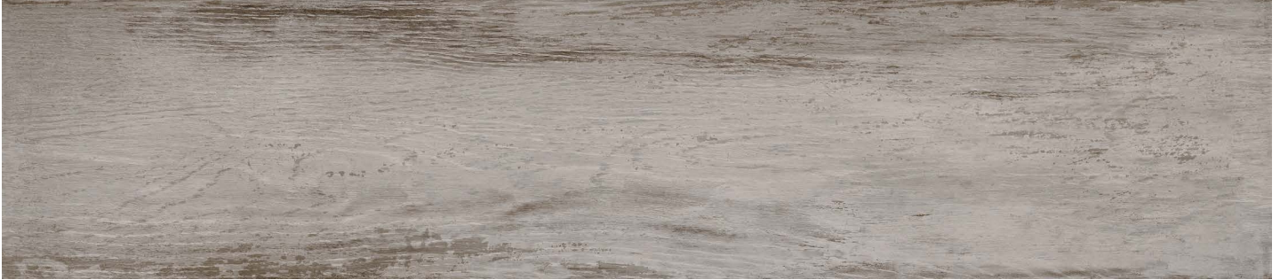
LCL20 8x36 Tavern