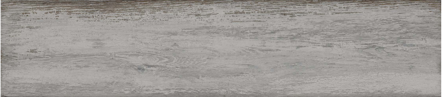
LCL40 8x36 Market