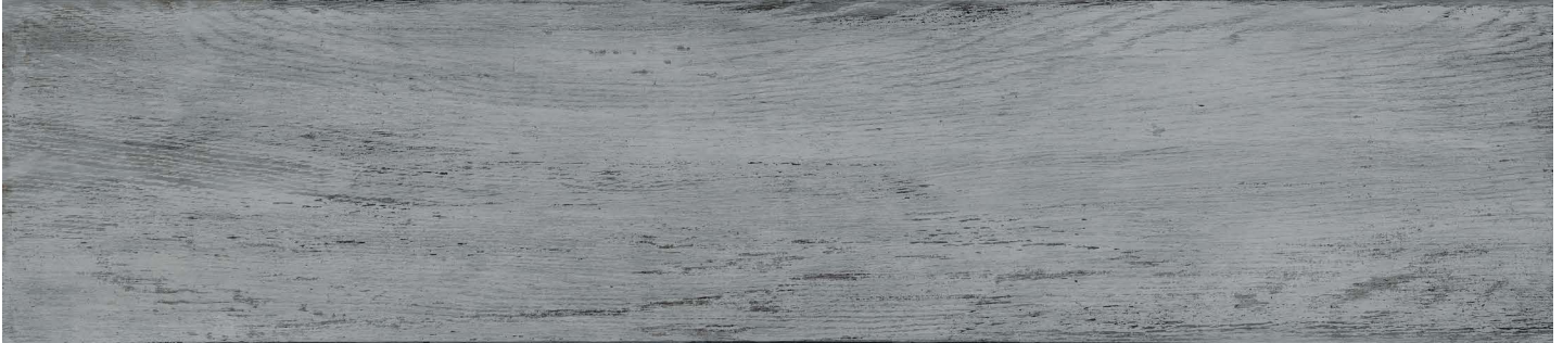
LCL50 8x36 Lounge