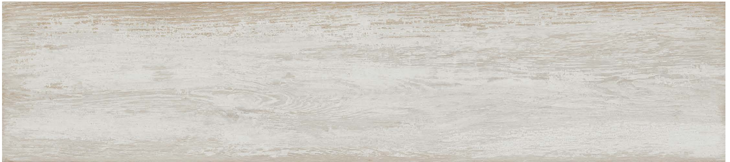
LCL10 8x36 Bistro