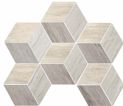
LCL123/M12CUBE Warm Mix Cube (Café, Bistro, and Tavern)