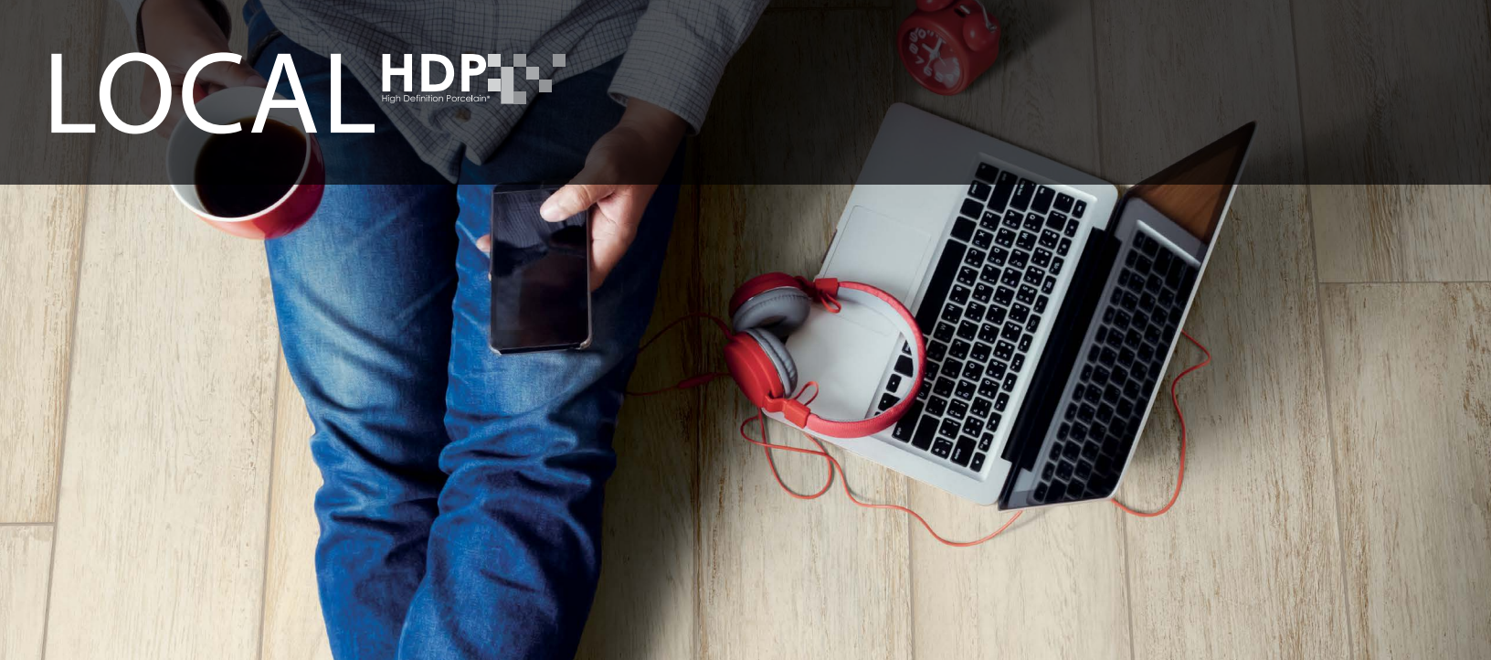
above: LCL30 8x36 Café