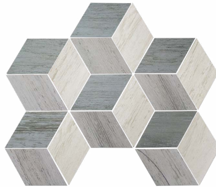
LCL145/M12CUBE Cool Mix Cube (Lounge, Bistro, and Market)