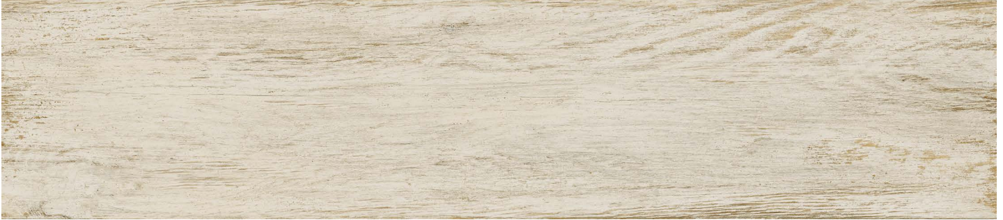
LCL30 8x36 Café